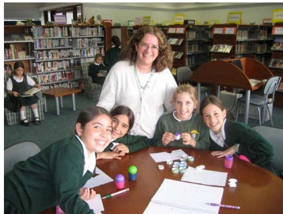
Library at British Schools

My advice to CALA members who are interested in Fulbright is: Get Involved . CALA has many wonderful programs with international connections, such as the wonderful programs sponsored by the International Relations Committee, CALA 21st Century Librarian Seminar Series , conferences in China, Hong Kong and Taiwan, to name only a few. As a CALA member, you also want to be active with the International Relations Committee at ALA. Fulbright is looking for people who can become the positive cultural ambassadors for its programs.