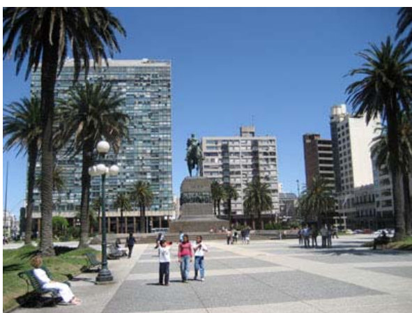
Independence Square, Montevideo, Uruguay