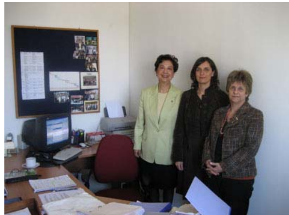
At Fulbright Office

The more well-known program is the Fulbright Traditional Program which provides the awardees opportunity of staying in a foreign country for 6 months or long teaching or doing research. When applying, the applicant is required to apply for a specific country listed in the Fulbright program book. Less known is the newer Fulbright Senior Specialist Program (FSSP) which gives the awardees opportunity of visiting a foreign country for 2-6 weeks. The country is assigned to, not applied for. In my case, I applied for the Fulbright Senior Specialist program and was assigned to Uruguay.